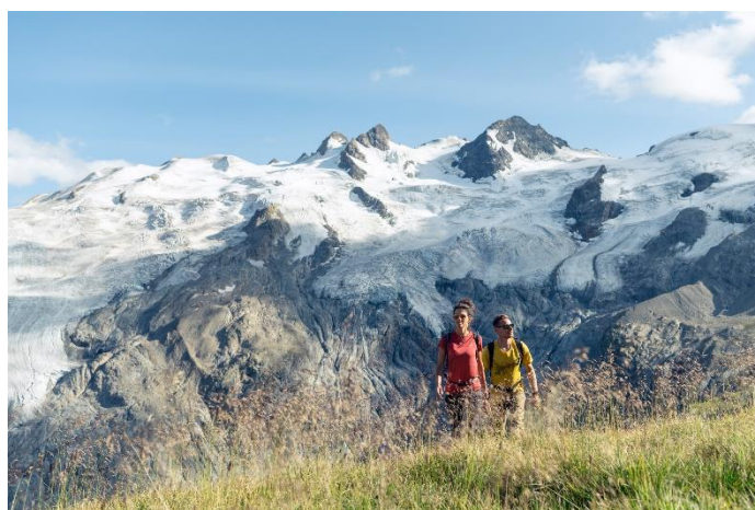
Cross-country at Val Roseg; Hiking at Bernina Glaciers

Summer visitors enjoy hiking, rock climbing, mountain biking and Nordic walking in the crisp mountain air, as well as lake-based activities such as sailing, windsurfing and kite-surfing at Silvaplana and wild swimming at Lej da Staz.